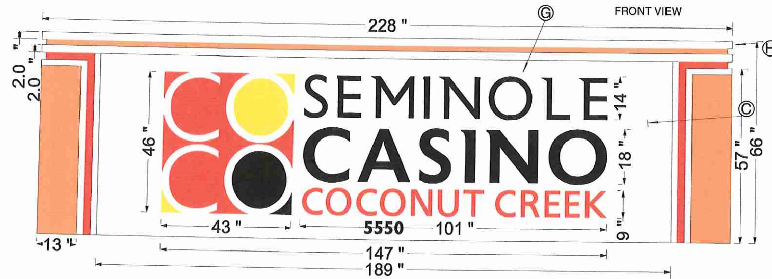
SIGN FACING SOUTH 441