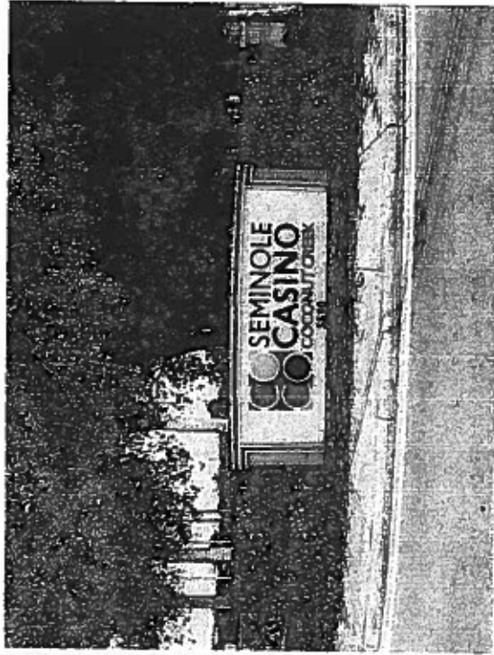
COMMERCE SQUARE SIGN REPLACEMENT

JOB ADDRESS 5550 NW 40th St. COCONUT CREEK FL. 33073