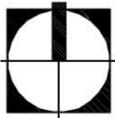
Secondary Street Pole