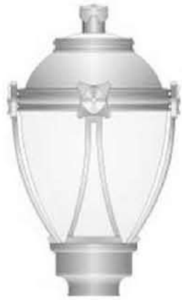
Parkway Lighting Model VILLAGE - LONDON Manufacturer BEACON