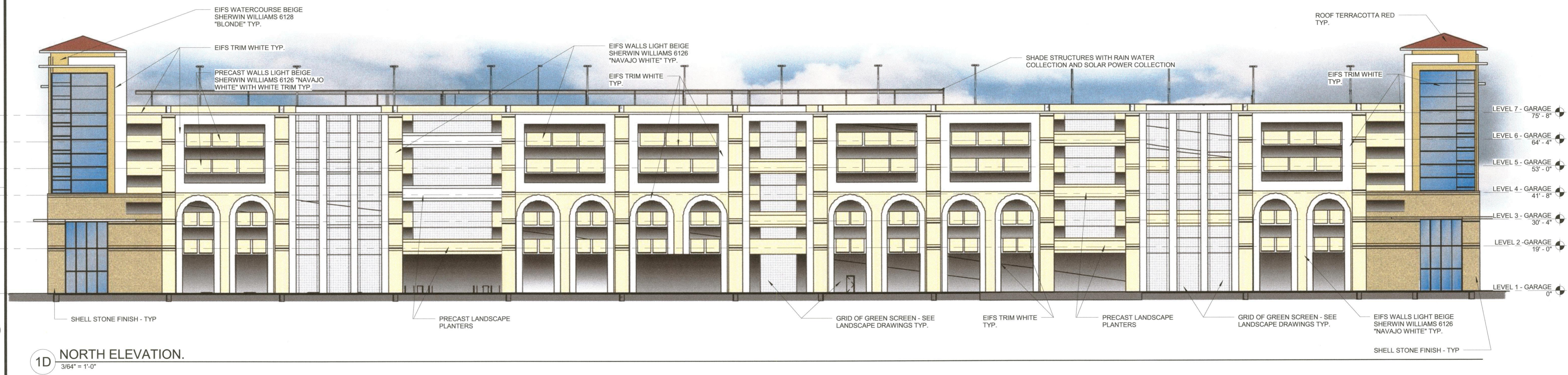
1D NORTH ELEVATION. 3/64" = 1'-0"