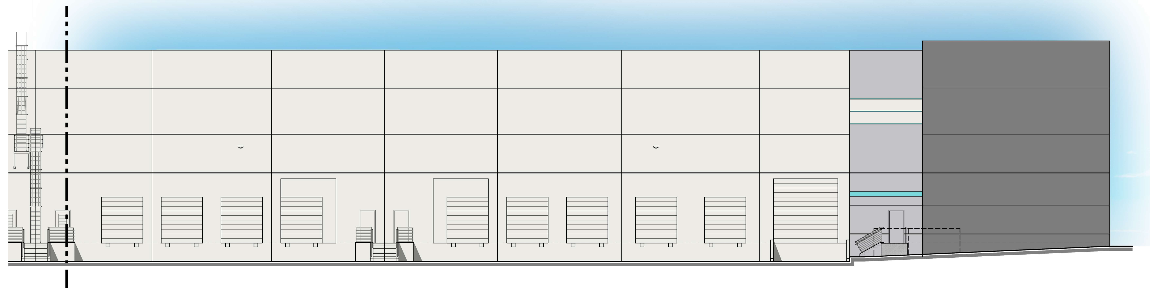
1 3/32"=1'-0" NORTH ELEVATION