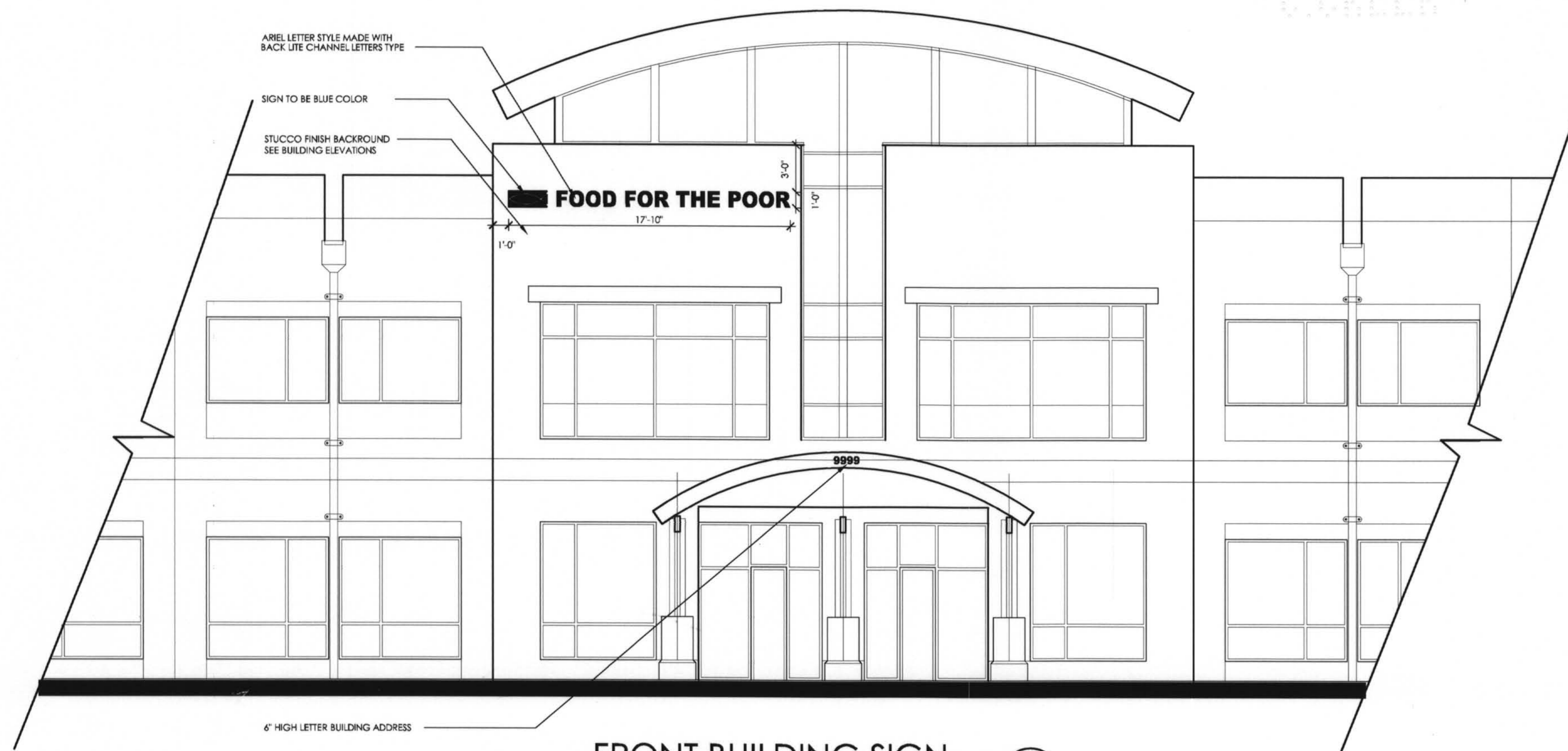
FRONT BUILDING SIGN 3/16" = 1'-0" 1 A5.0