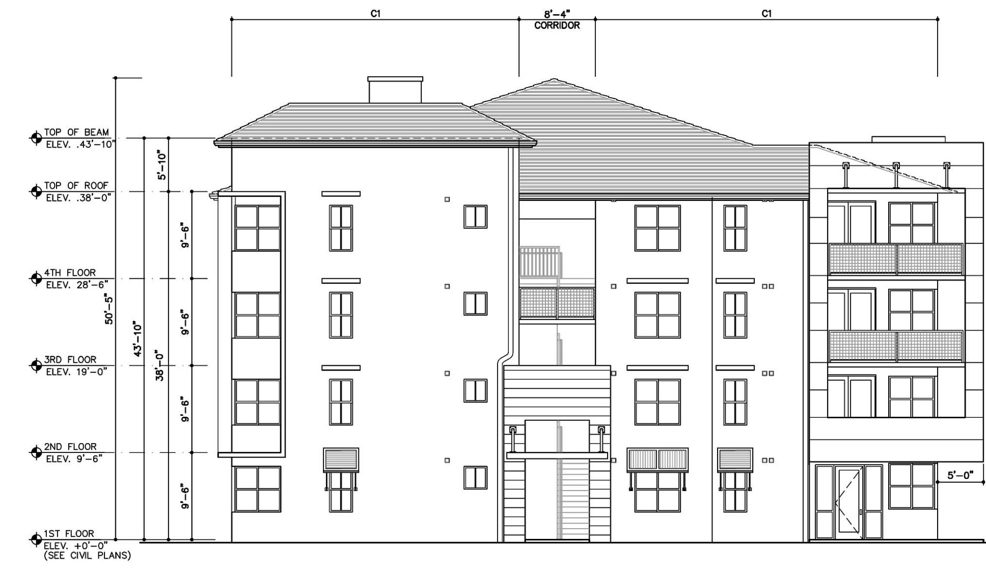
D SIDE ELEVATION (BUILDING 2) SCALE: 3/32"=1'-0"