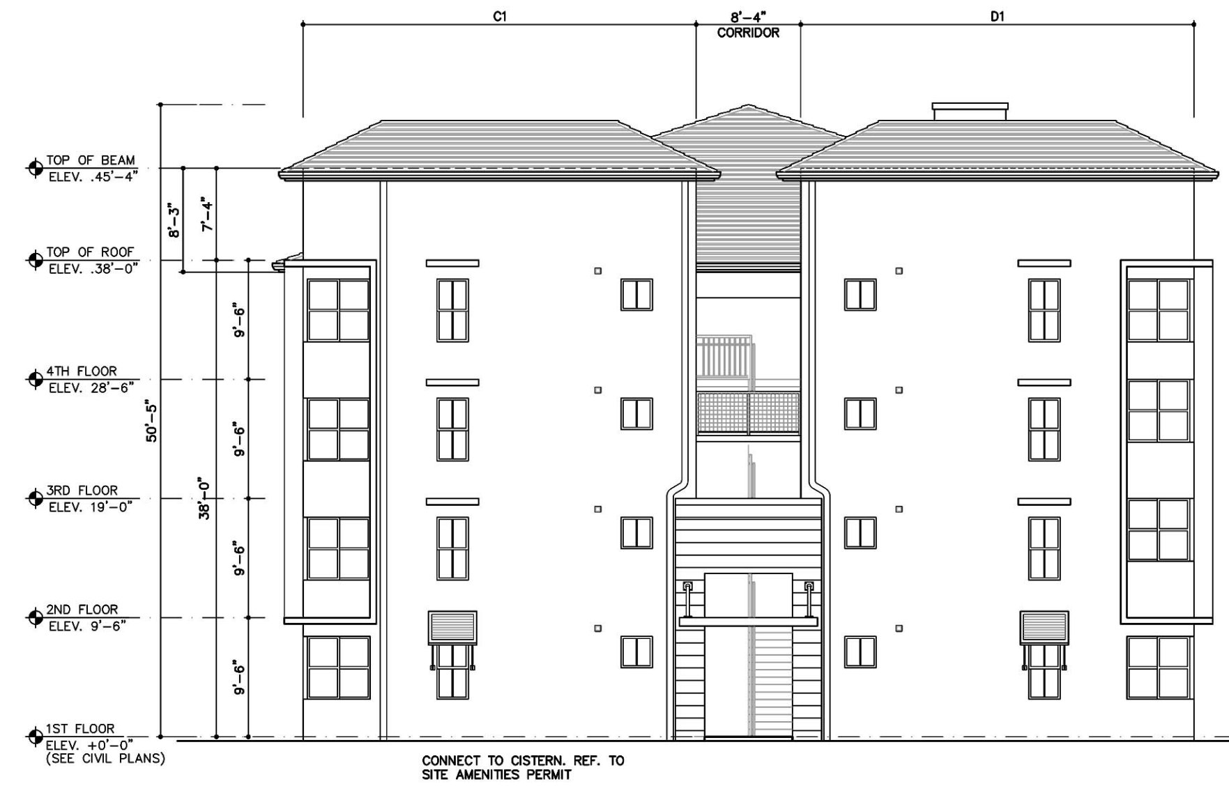
C SIDE ELEVATION (BUILDING 2) SCALE: 3/32"=1'-0"