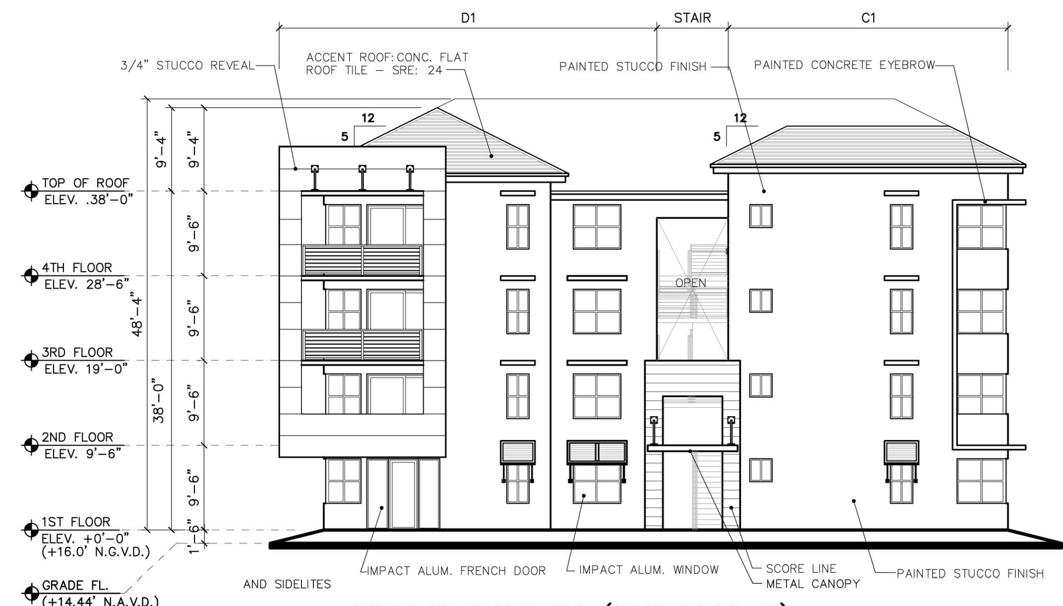
D SIDE ELEVATION (BUILDING 2) SCALE: 3/32"=1'-0"