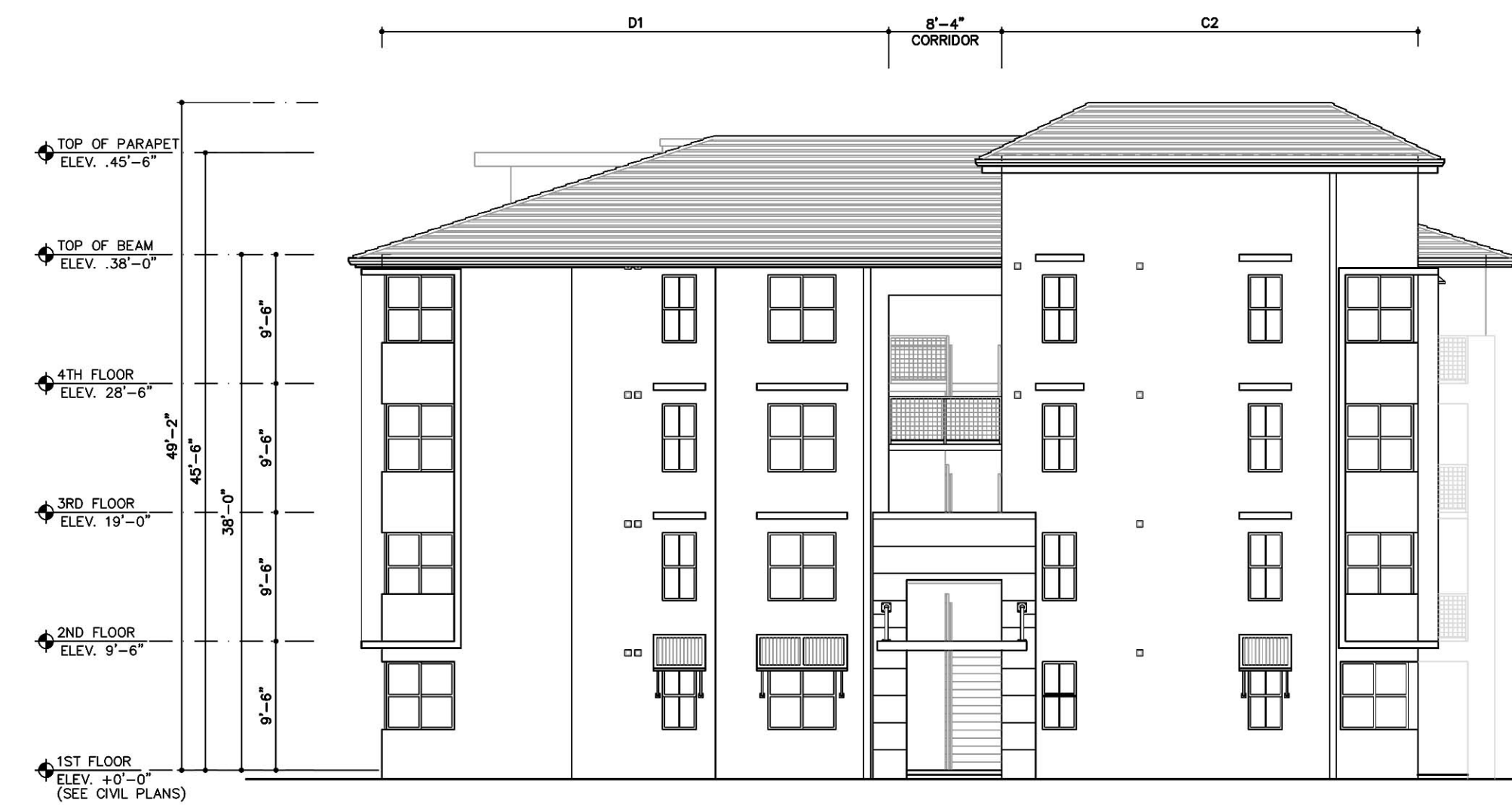
D SIDE ELEVATION—(BUILDING 4) SCALE: 3/32"=1'-0"

GENERAL REVISION NARRATIVE : 1. CHANGED RAILING STYLE TO MESH. 2. MODIFIED ROOF LINE. 3. SHOW DOWNSPOUTS.