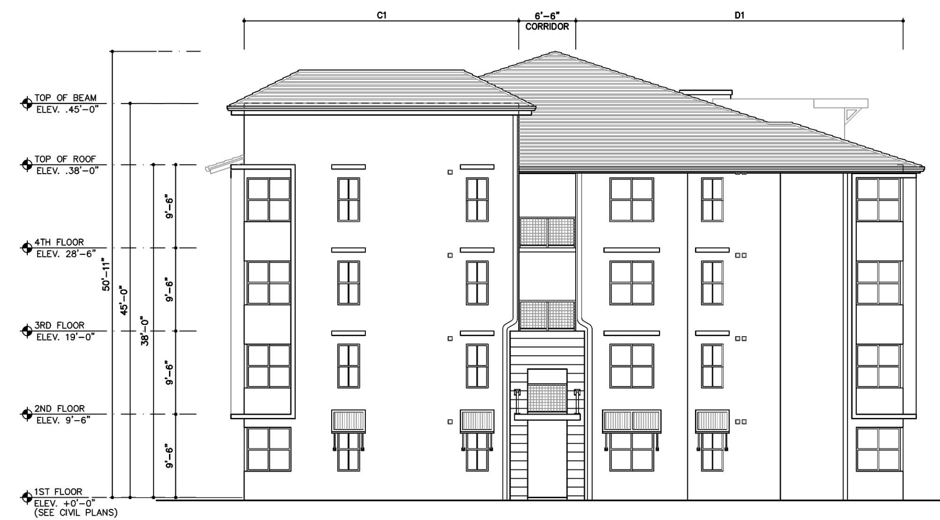
C SIDE ELEVATION—(BUILDING 4) SCALE: 3/32"=1'-0"