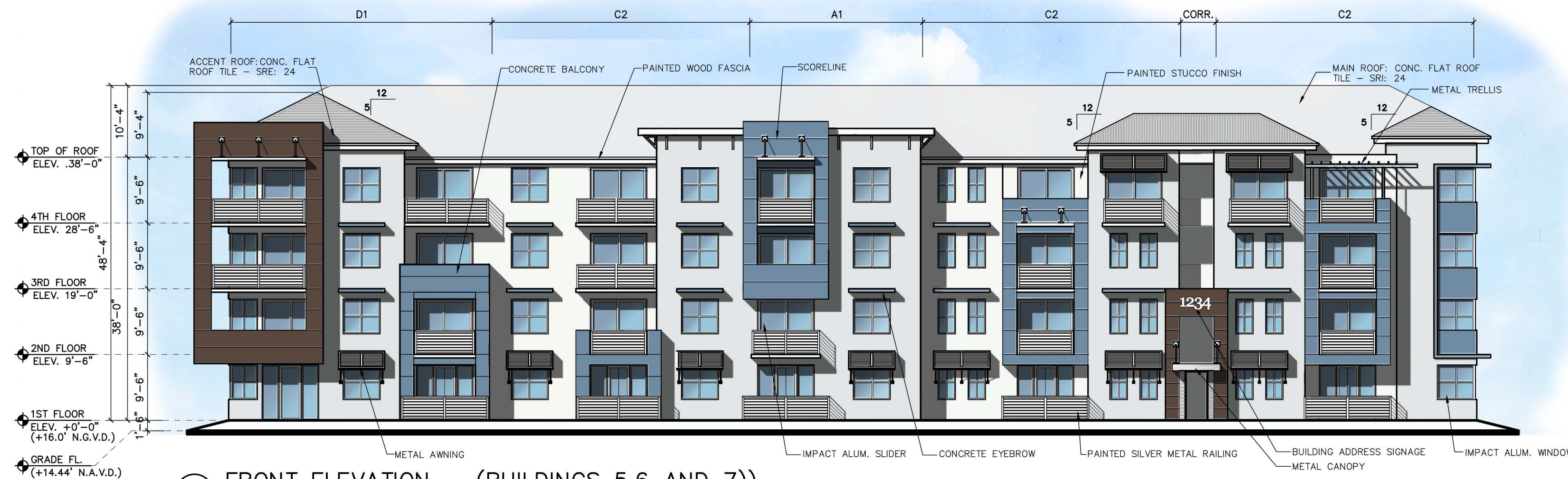
(A) FRONT ELEVATION - (BUILDINGS 5,6 AND 7)