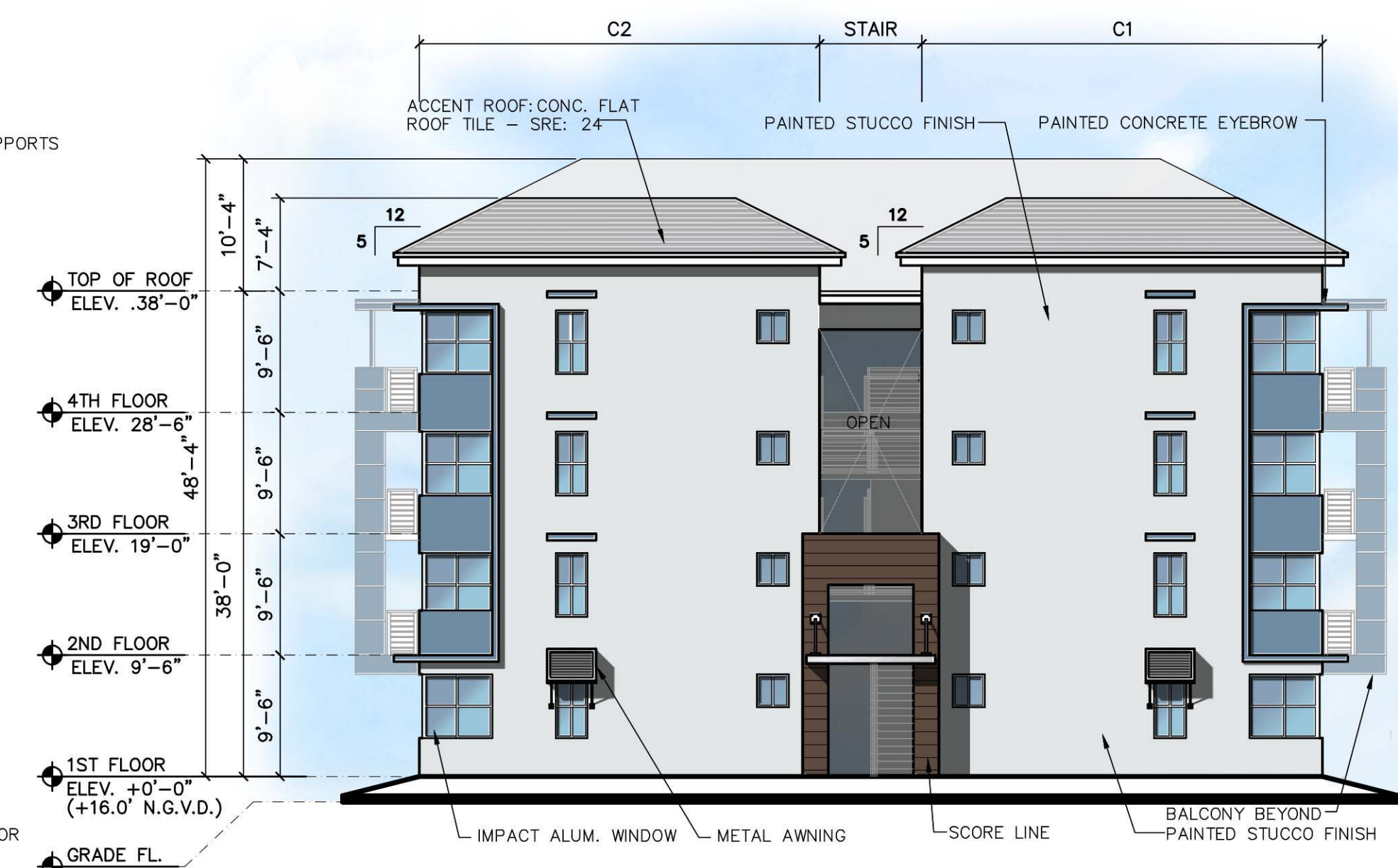
(D) SIDE ELEVATION (BUILDINGS 5,6 AND 7)