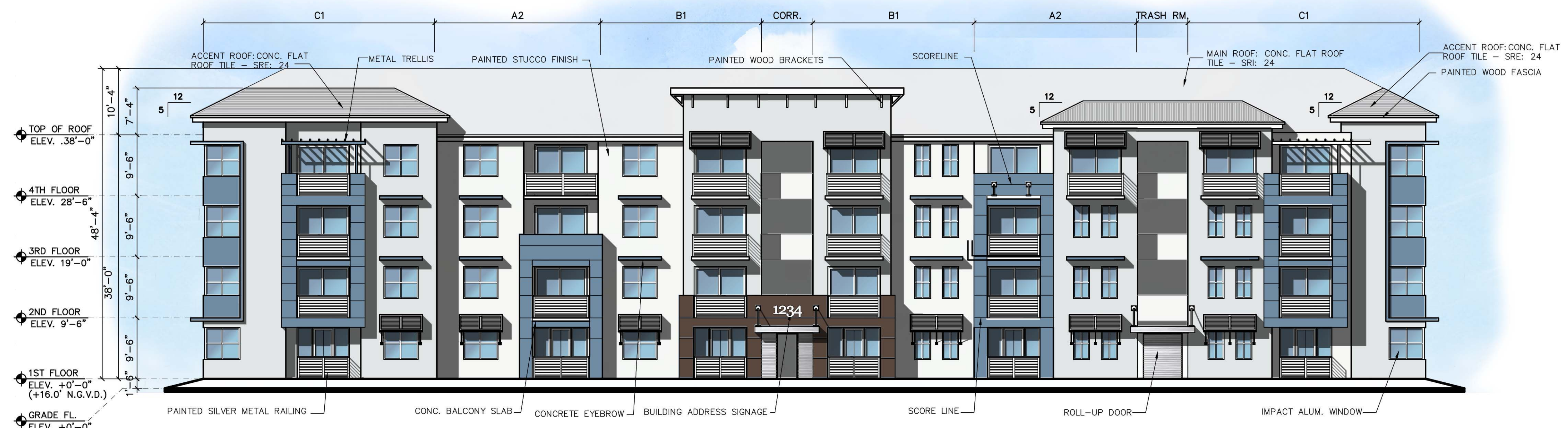
(B) REAR ELEVATION (BUILDINGS 5,6 AND 7)