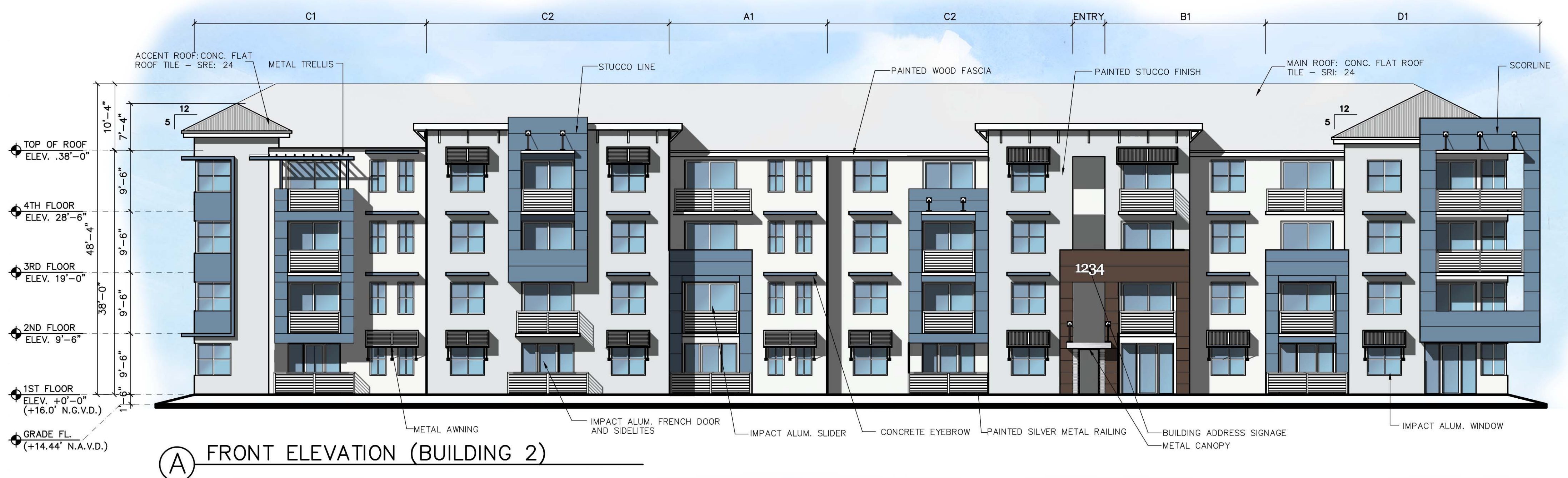
(A) FRONT ELEVATION (BUILDING 2)

GENERAL NOTE: 1. CLEAR FLOOR TO CEILING HEIGHT SHALL RANGE FROM: +7'-6" TO +9'-0" A.F.F.