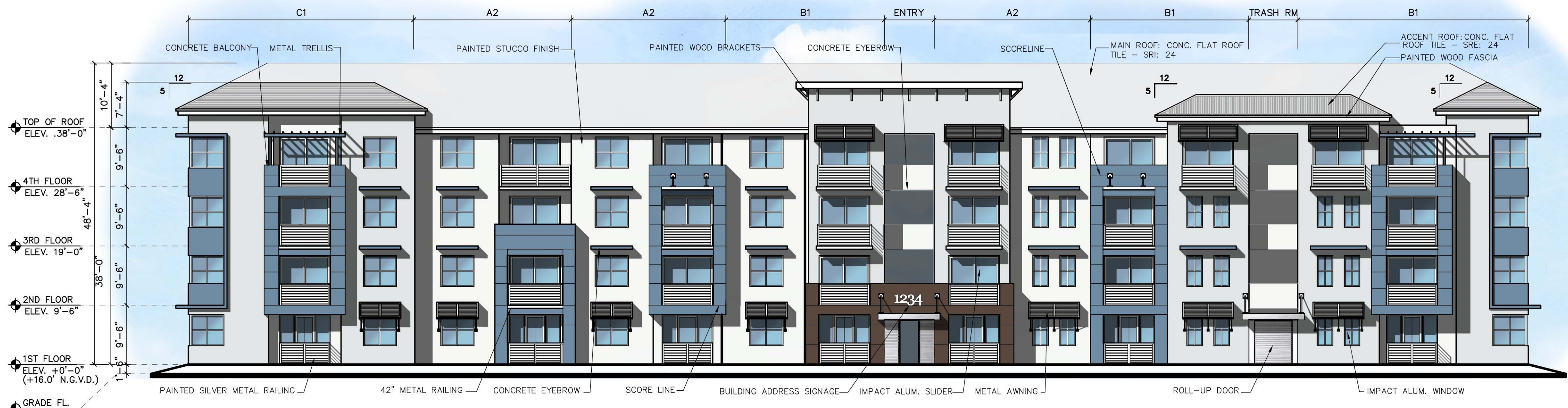
(B) REAR ELEVATION (BUILDING 2)