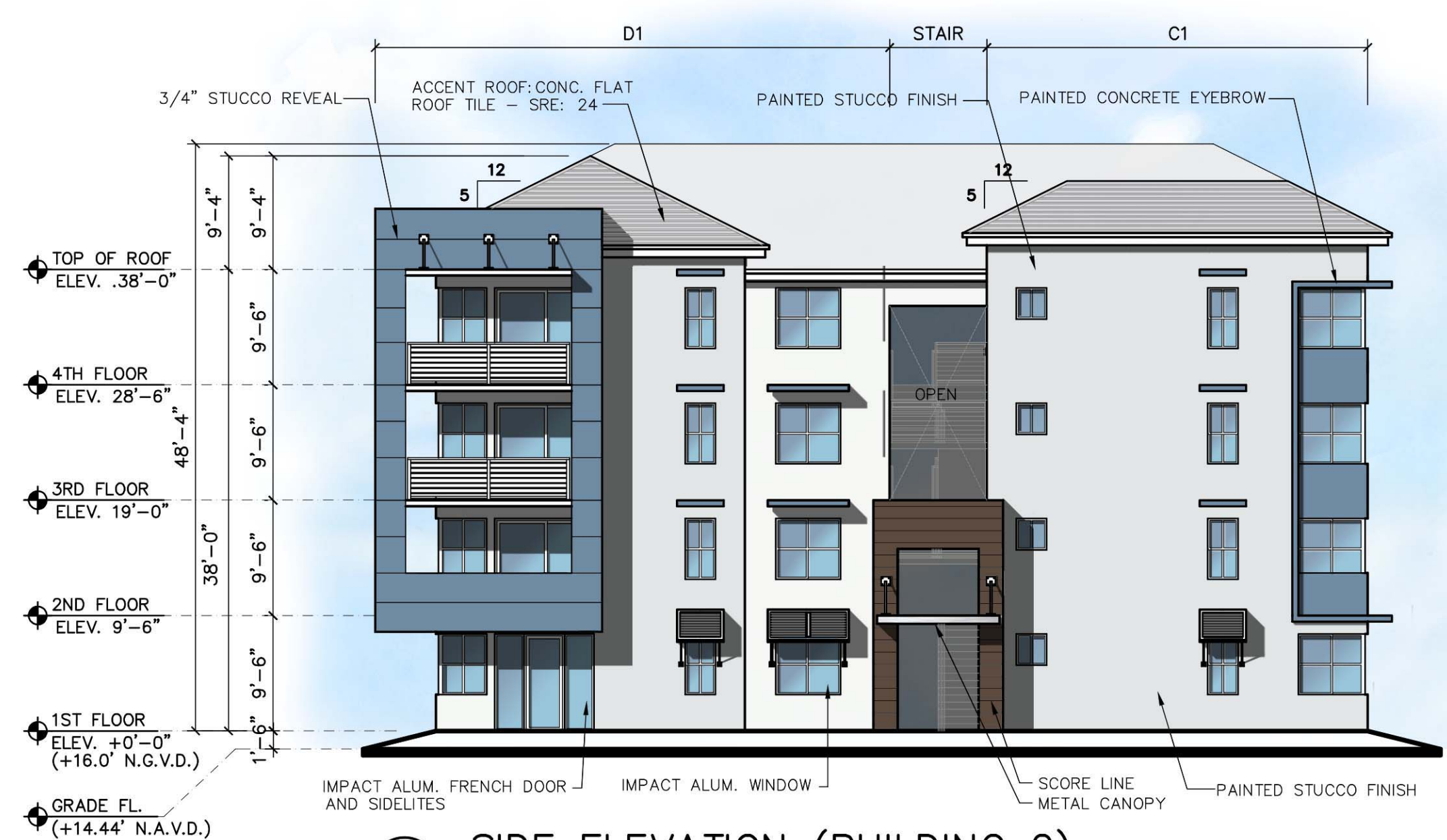
(D) SIDE ELEVATION (BUILDING 2)