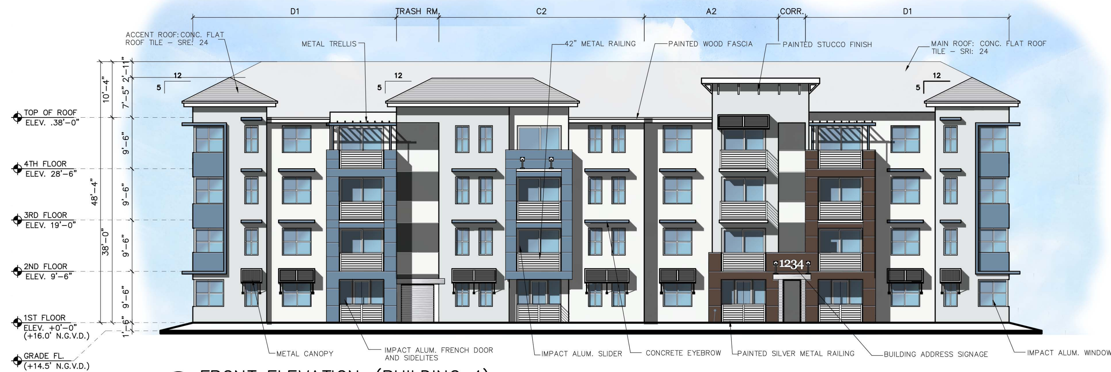
(A) FRONT ELEVATION--(BUILDING 4)