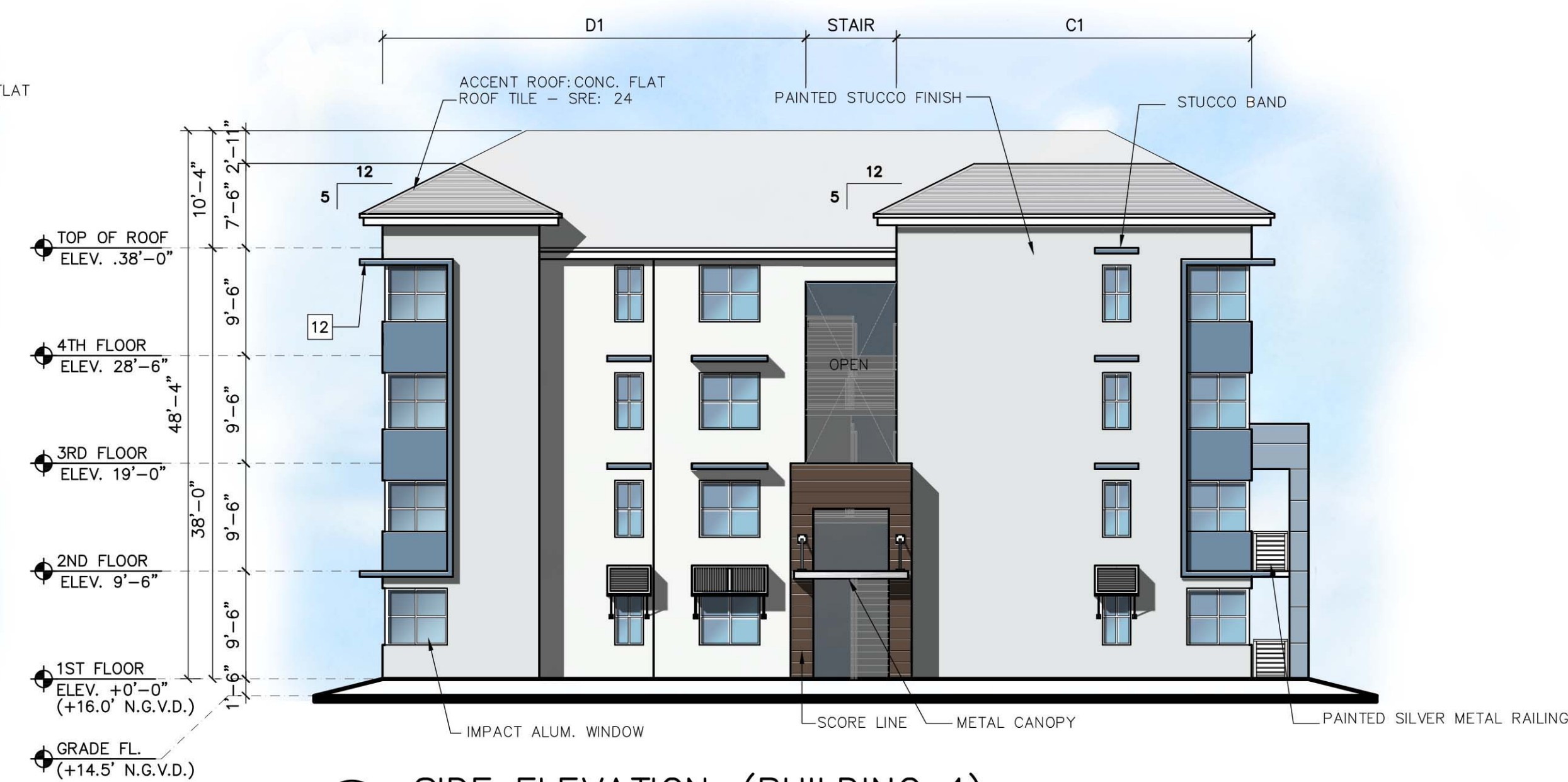
(D) SIDE ELEVATION--(BUILDING 4)

GENERAL NOTE: 1. CLEAR FLOOR TO CEILING HEIGHT SHALL RANGE FROM: +7'-6" TO +9'-0" A.F.F.