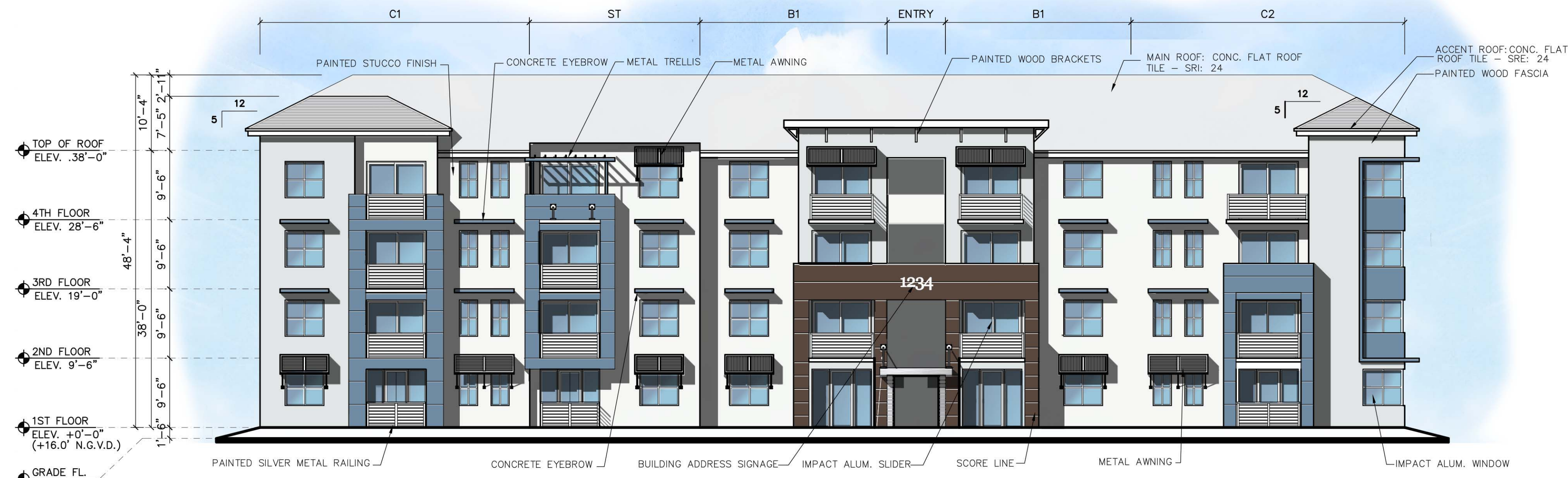
(B) REAR ELEVATION--(BUILDING 4)