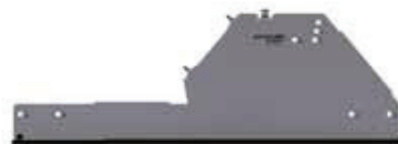
Polar Bear® FR