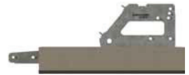
Grizzly Bear® FR