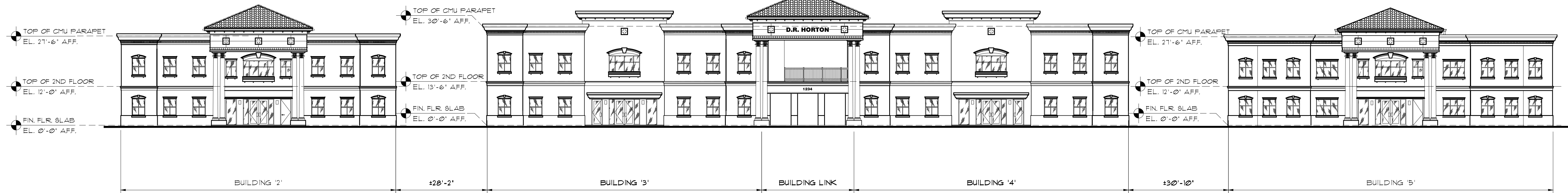
2 PROJECT EAST ELEVATION 1/16" = 1'-0"

D. R. HORTON HEADQUARTERS SAUGRASS BOULEVARD COCONUT CREEK, FLORIDA 33---