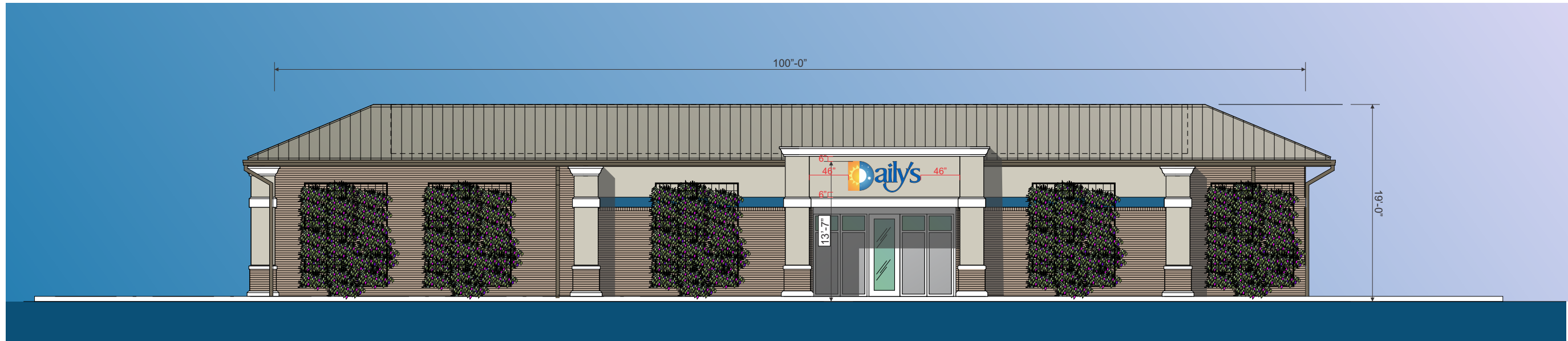
East Elevation - Custom 40" Remote Channel Letters 3/32" = 1'-0"