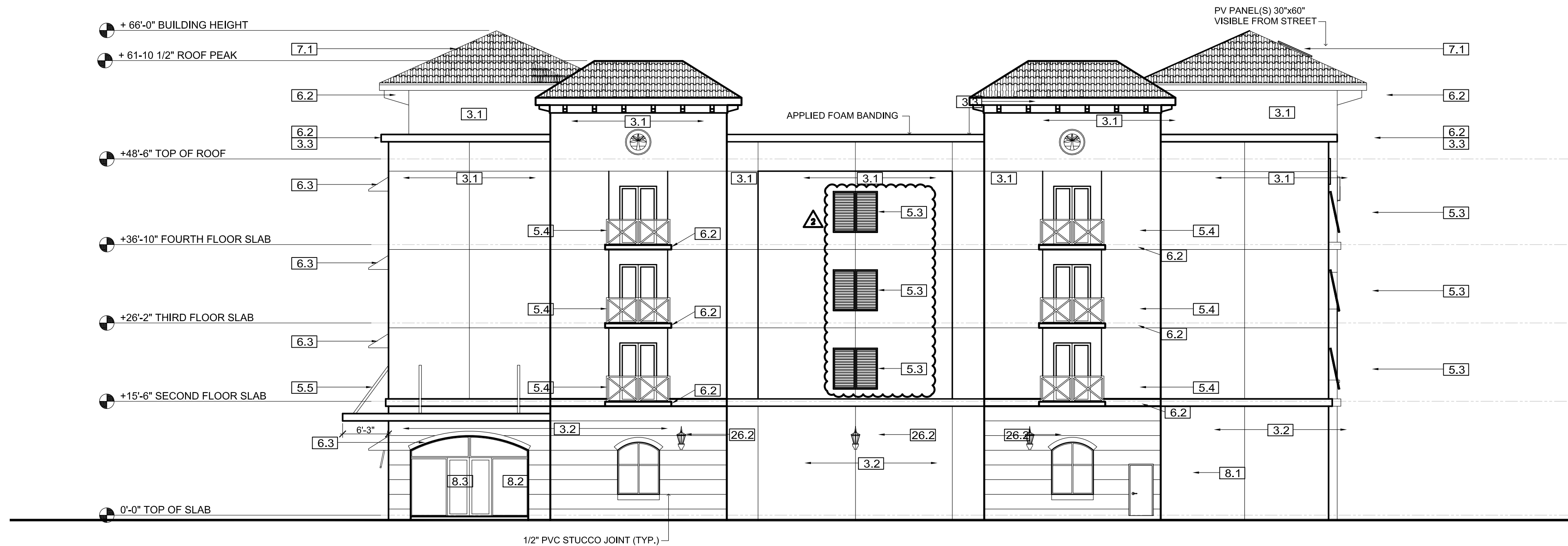
1 WEST ELEVATION SCALE: 3/32" = 1'-0"