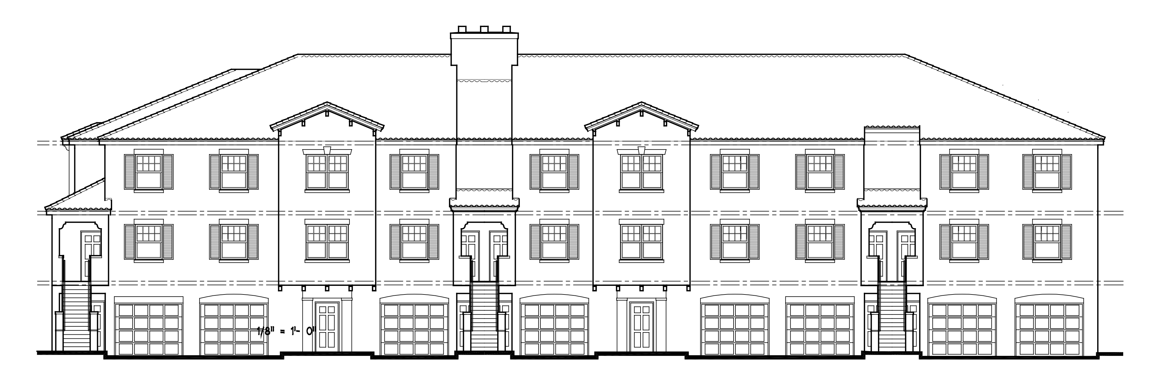
02 BUILDING TYPE IV- GARAGE SIDE ELEVATION (BUILDING NO. 7) 1/8" = 1<sup>1</sup>- 0"