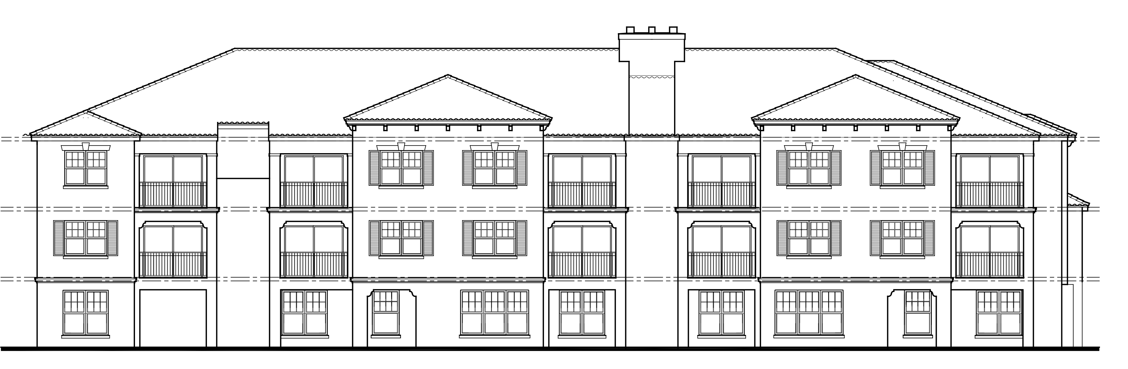
BUILDING TYPE IV - VIEW SIDE ELEVATION (BUILDING NO. 7)

NOT TO BE COPIED, USED OR REPRODUCED WITHOUT WRITTEN PERMISSION.