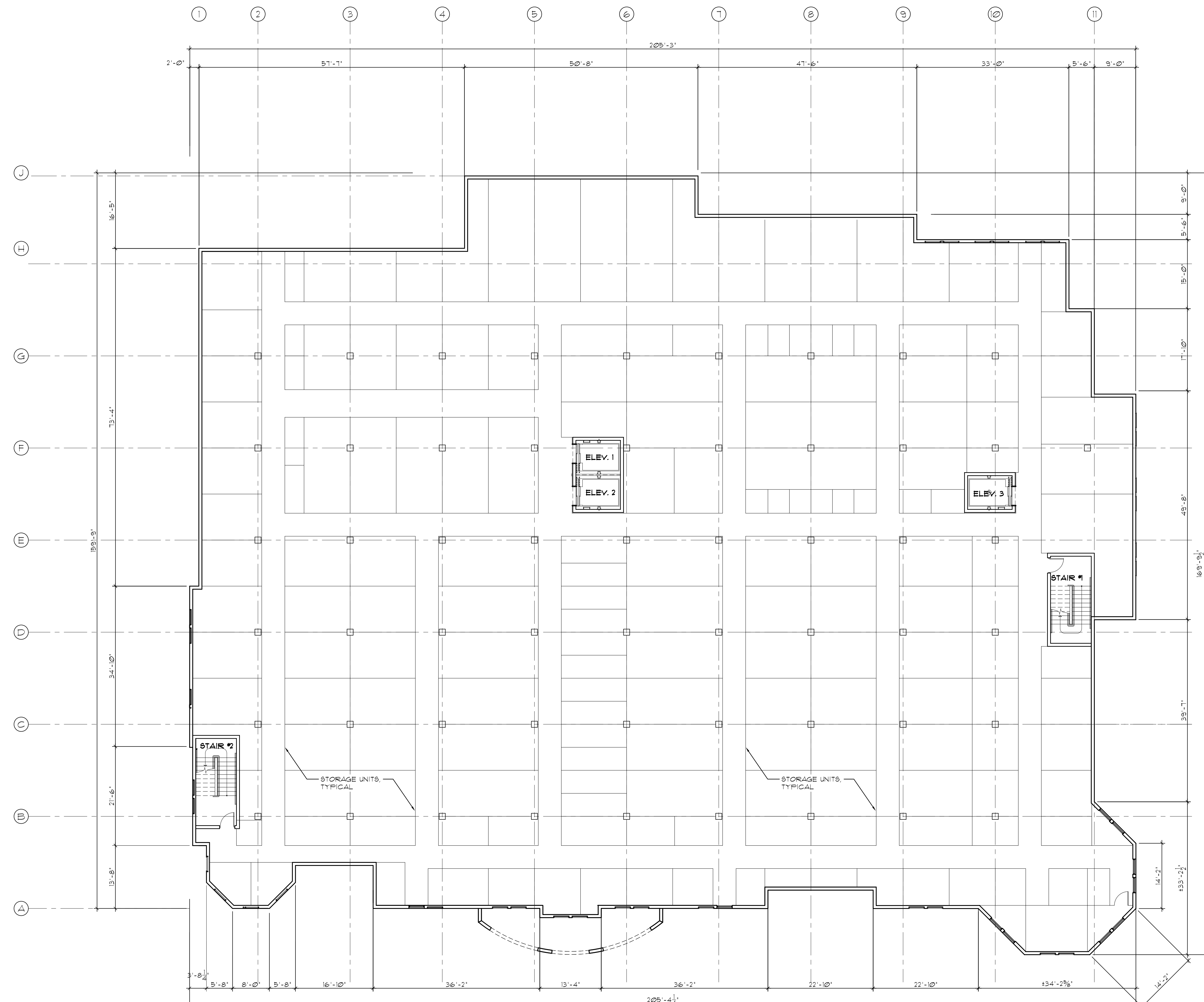
1 A4.2 THIRD FLOOR PLAN 3/32"=1'-0"