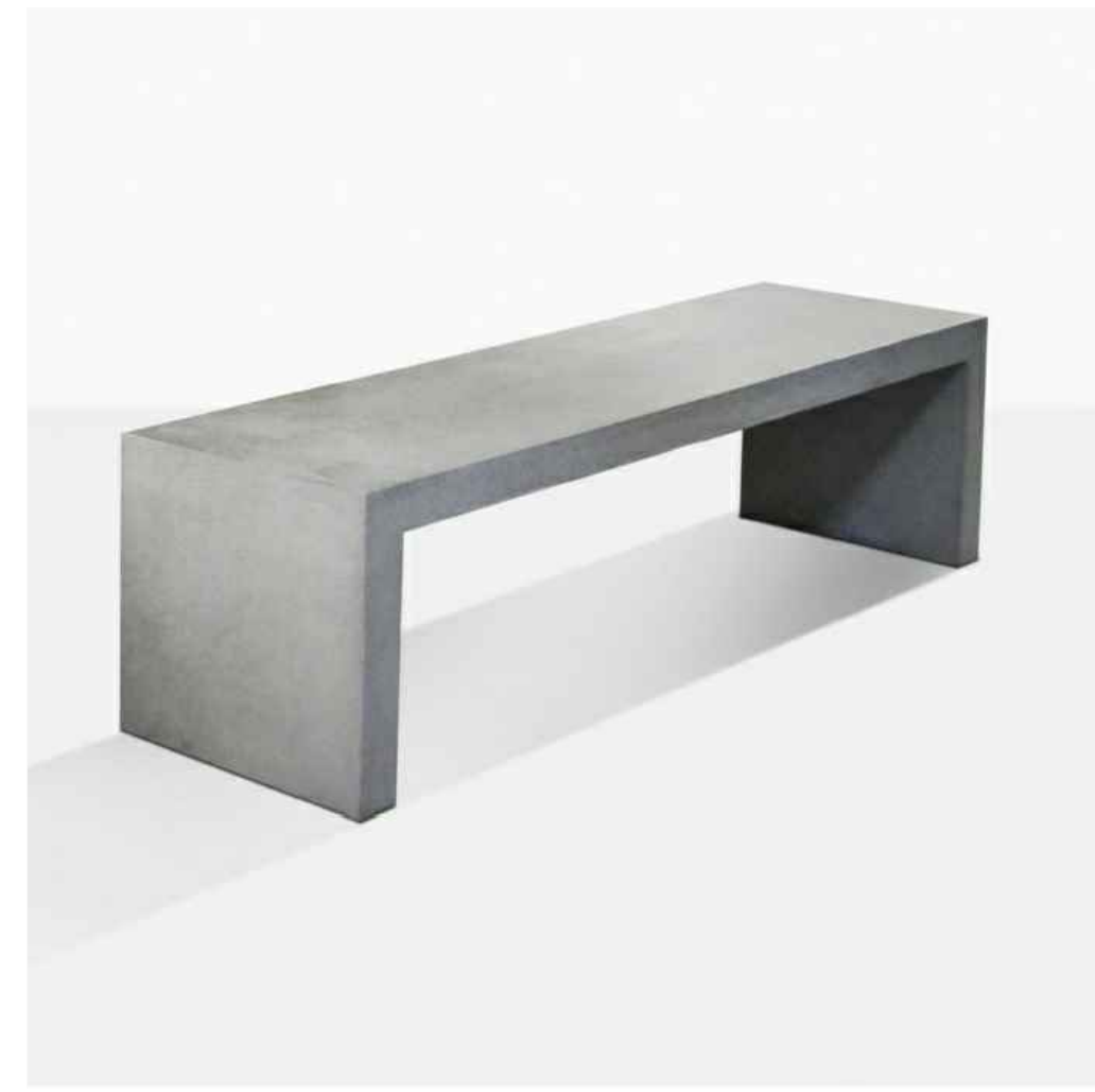
1 BENCH (NTS)

MANUFACTURER: WWW.TEAKWAREHOUSE.COM MODEL: RAW MODERN LIGHTWEIGHT OUTDOOR SIZE: 16"W X 63"L X 18"HT