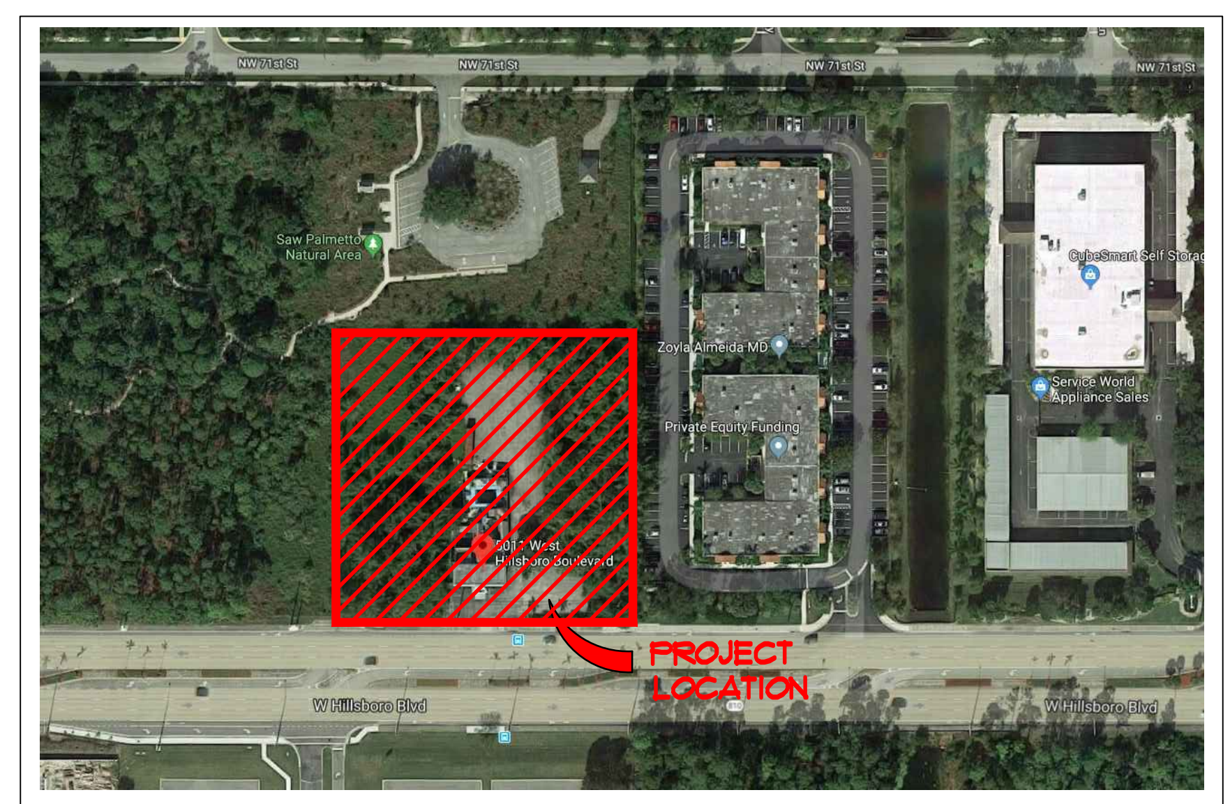
LOCATION MAP N.T.S.