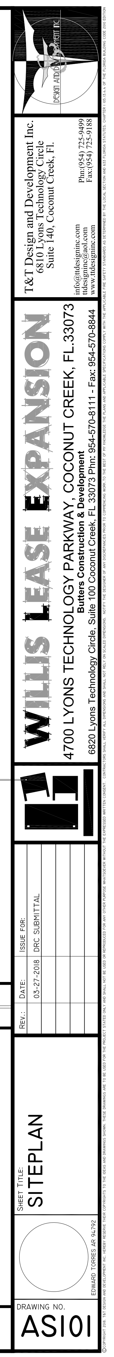
1 SCHEMATIC SITEPLAN Scale: 1" = 30'