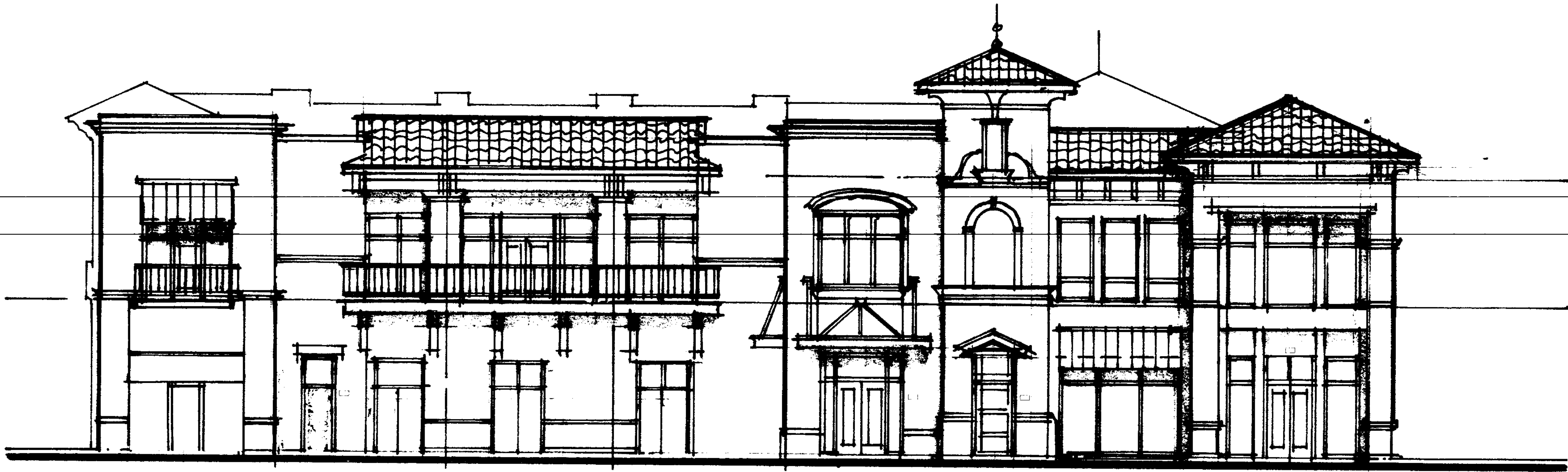
Building B South Elevation- 3 s.f. of signage above/near the rear entrance doors

Note: Address numerals for each tenant space will be installed at each rear access door.