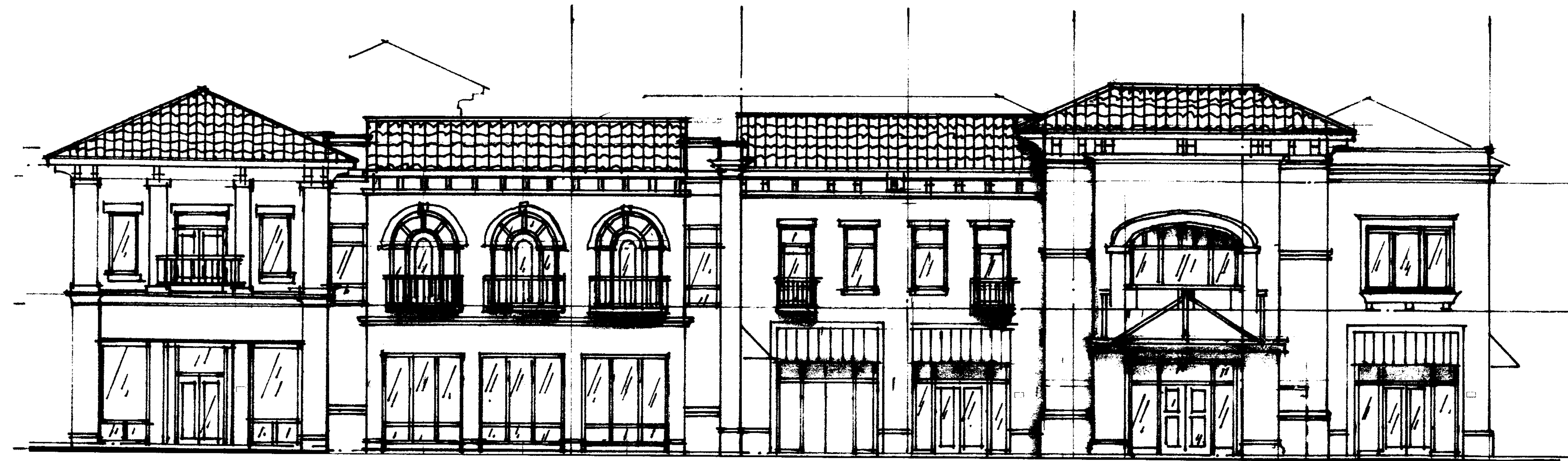
Building E West Elevation- 3 s.f of signage above/near the rear entrance doors

Note: Address numerals for each tenant space will be installed at each rear access door.